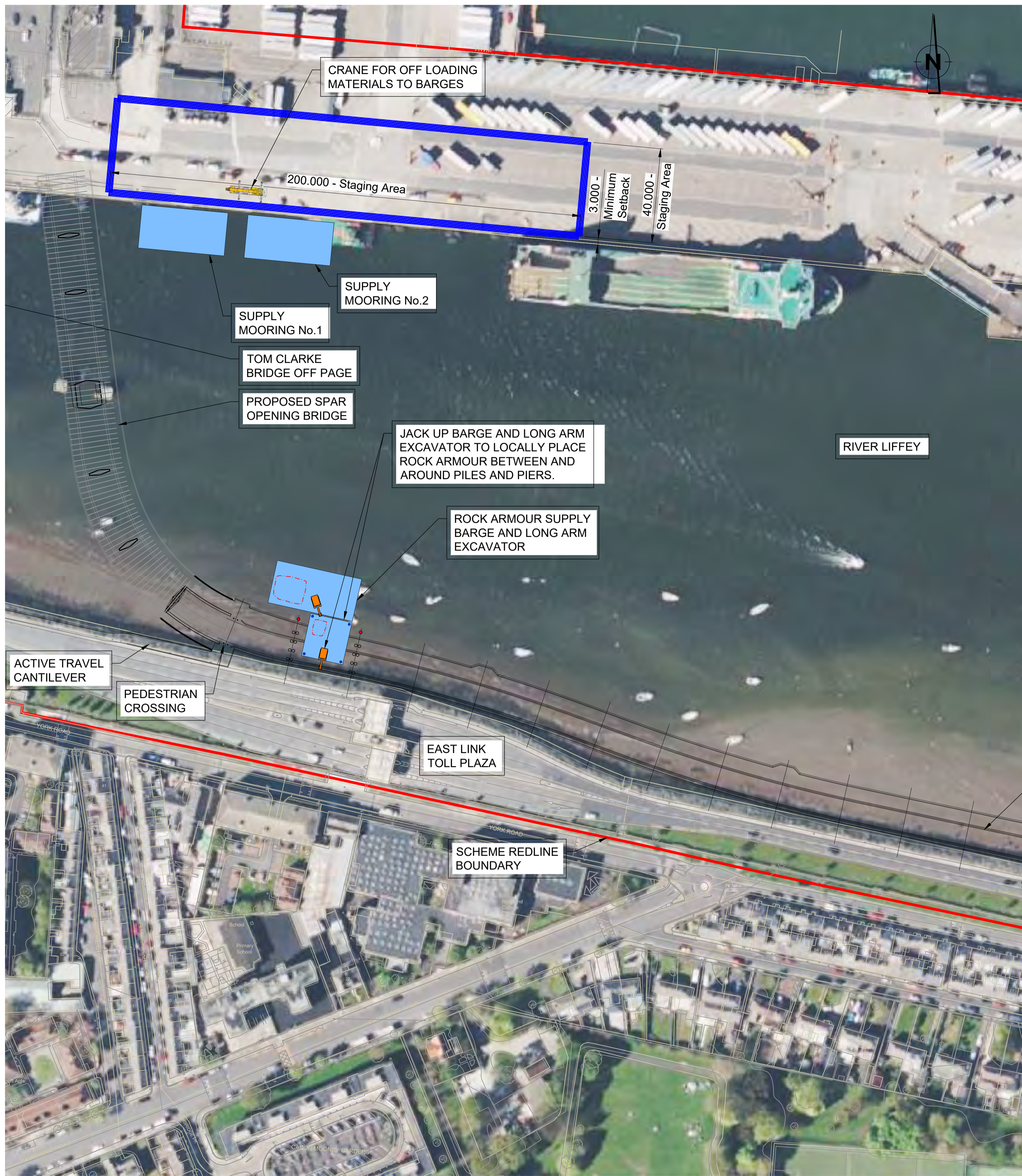
STAGE 5 - PLACING ROCK ARMOUR - PLAN (Scale 1 : 1,000)