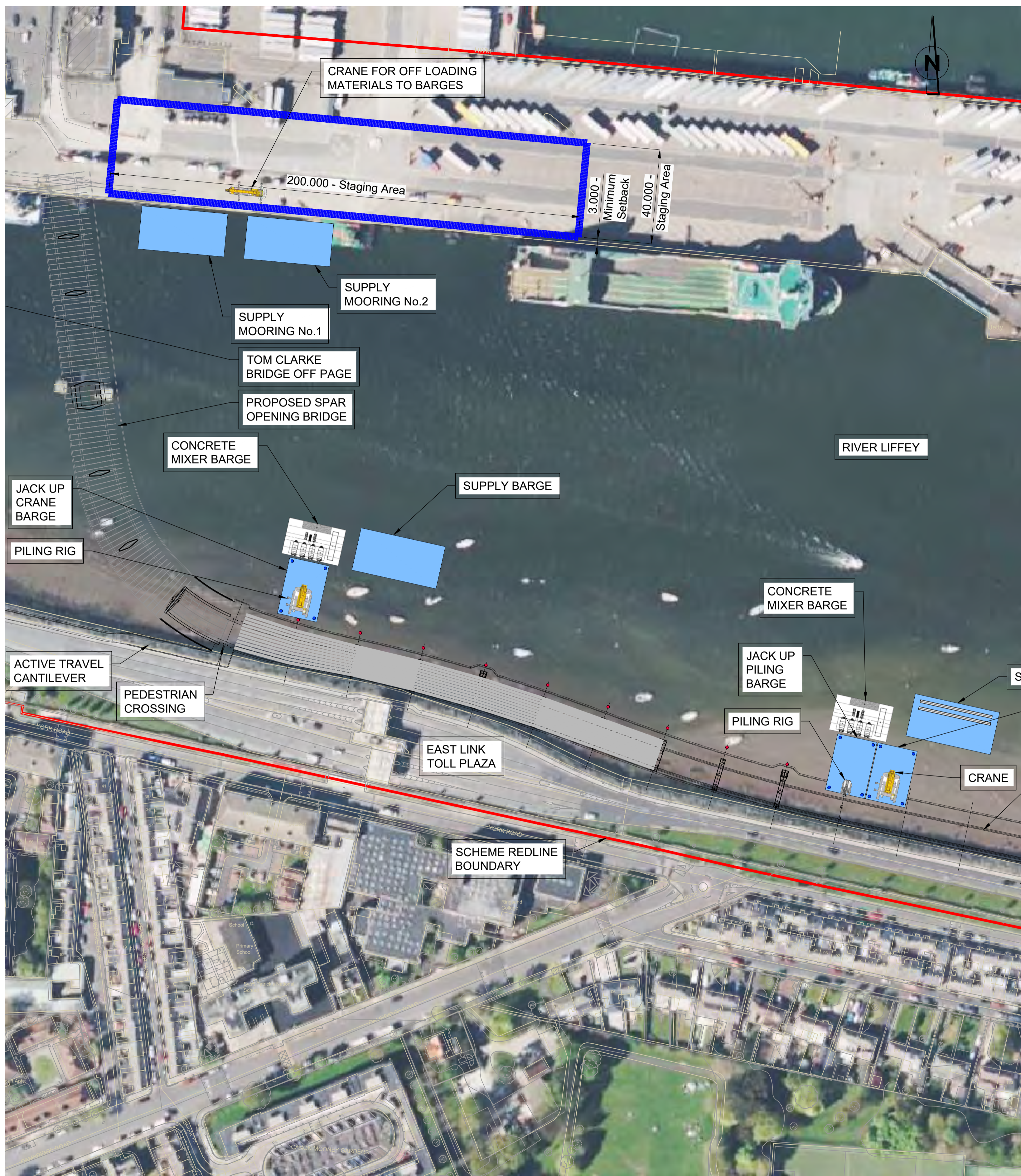
STAGE 9 - CONSTRUCT R.C. CANTILEVERS - PLAN (Scale 1 : 1,000)