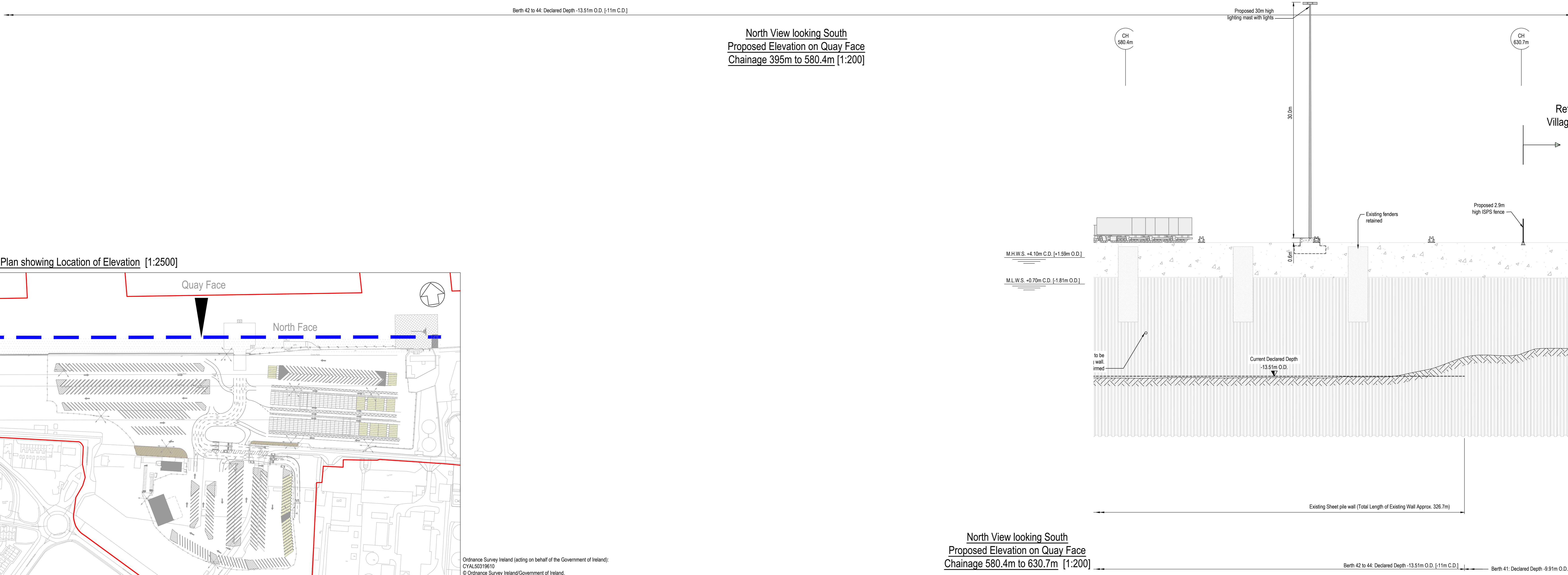
North View looking South Proposed Elevation on Quay Face Chainage 580.4m to 630.7m [1:200]