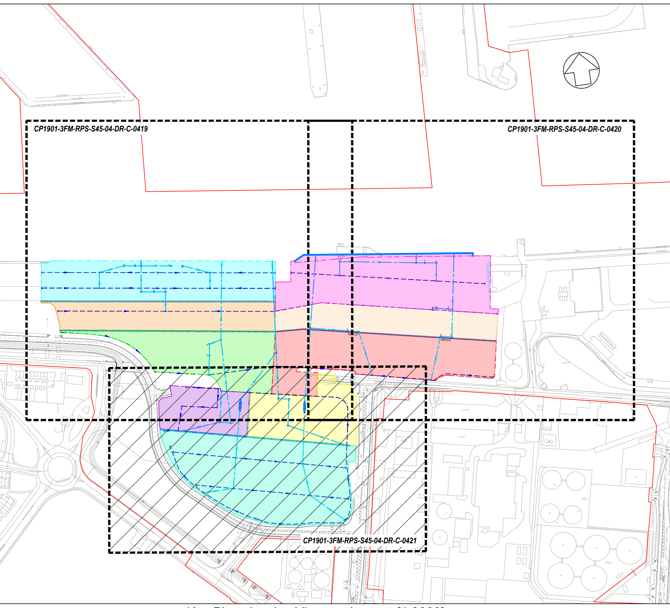
Key Plan showing Viewport Layout [1:3000]