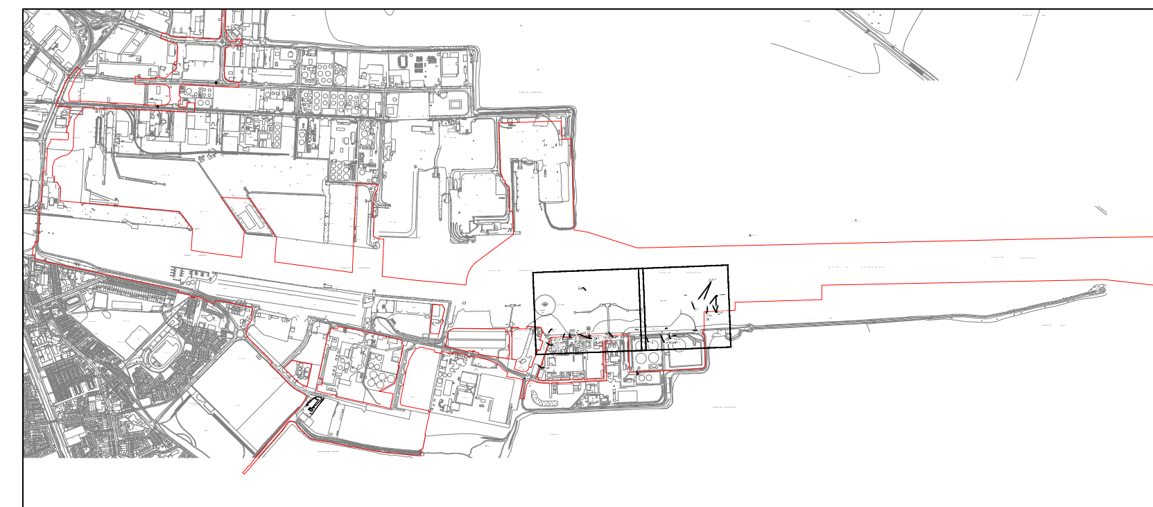
Overall Key Map showing Location of Lo-Lo Container Terminal (Area N) [1:25000]