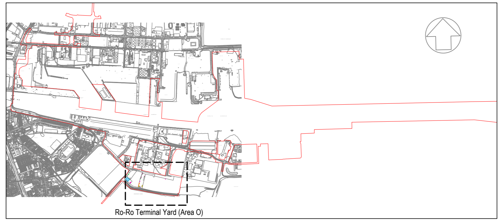
Overall Key Plan showing Location of Ro-Ro Terminal Yard (Area O) [1:25000]