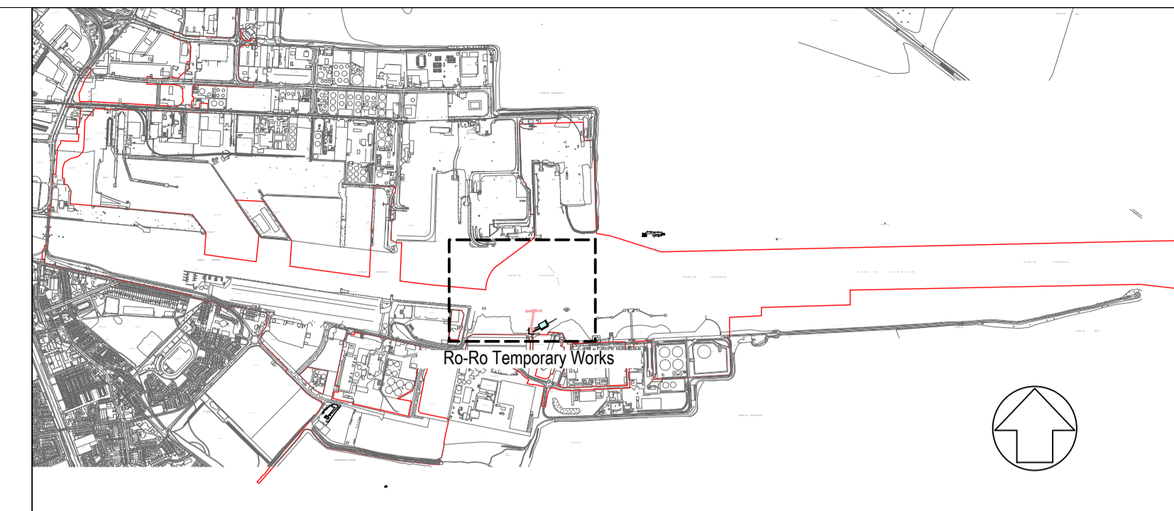
Overall Key Plan showing Location of Ro-Ro Temporary Works [1:25000]

Ordnance Survey Ireland (acting on behalf of the Government of Ireland); CYAL50319610 © Ordnance Survey Ireland/Government of Ireland.