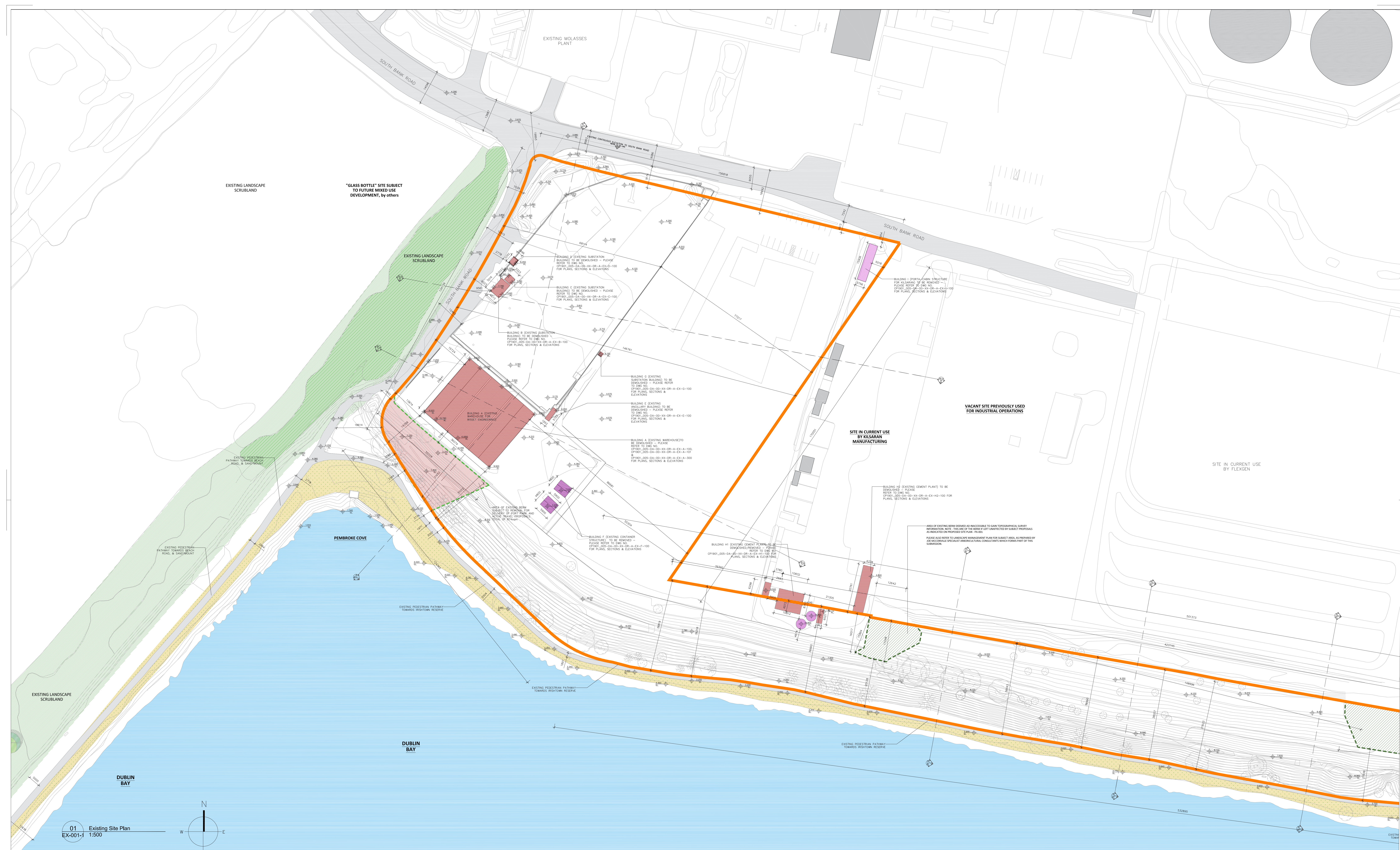
01 Existing Site Plan EX-001-1 1:500