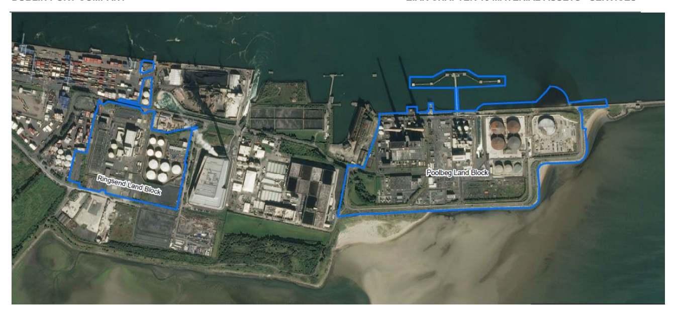
Figure 15.1 ESB and NORA Utility Sites proximate to the 3FM Project