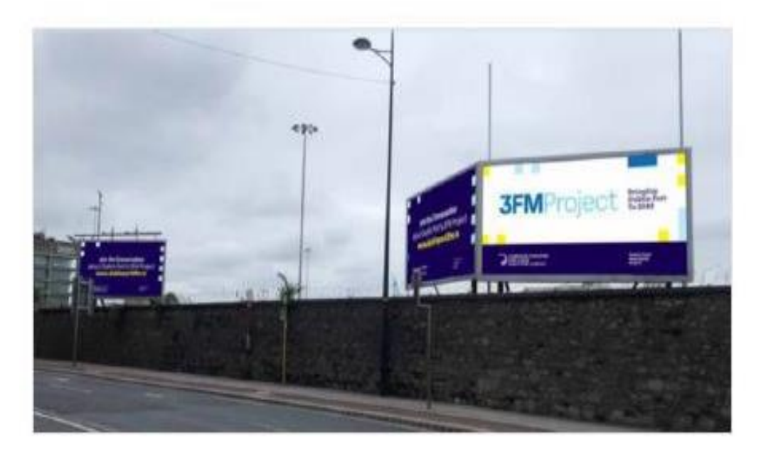
Plate 3.1 Billboard advertising of 3FM Project VCR

The VCR was an online interactive space where the public could learn more about the 3FM Project and have their say. Care was taken to present information in a user-friendly way to aid visualisation and understanding of the project. Key elements of the VCR are shown in the following images (Plates 3.2 to 3.3).