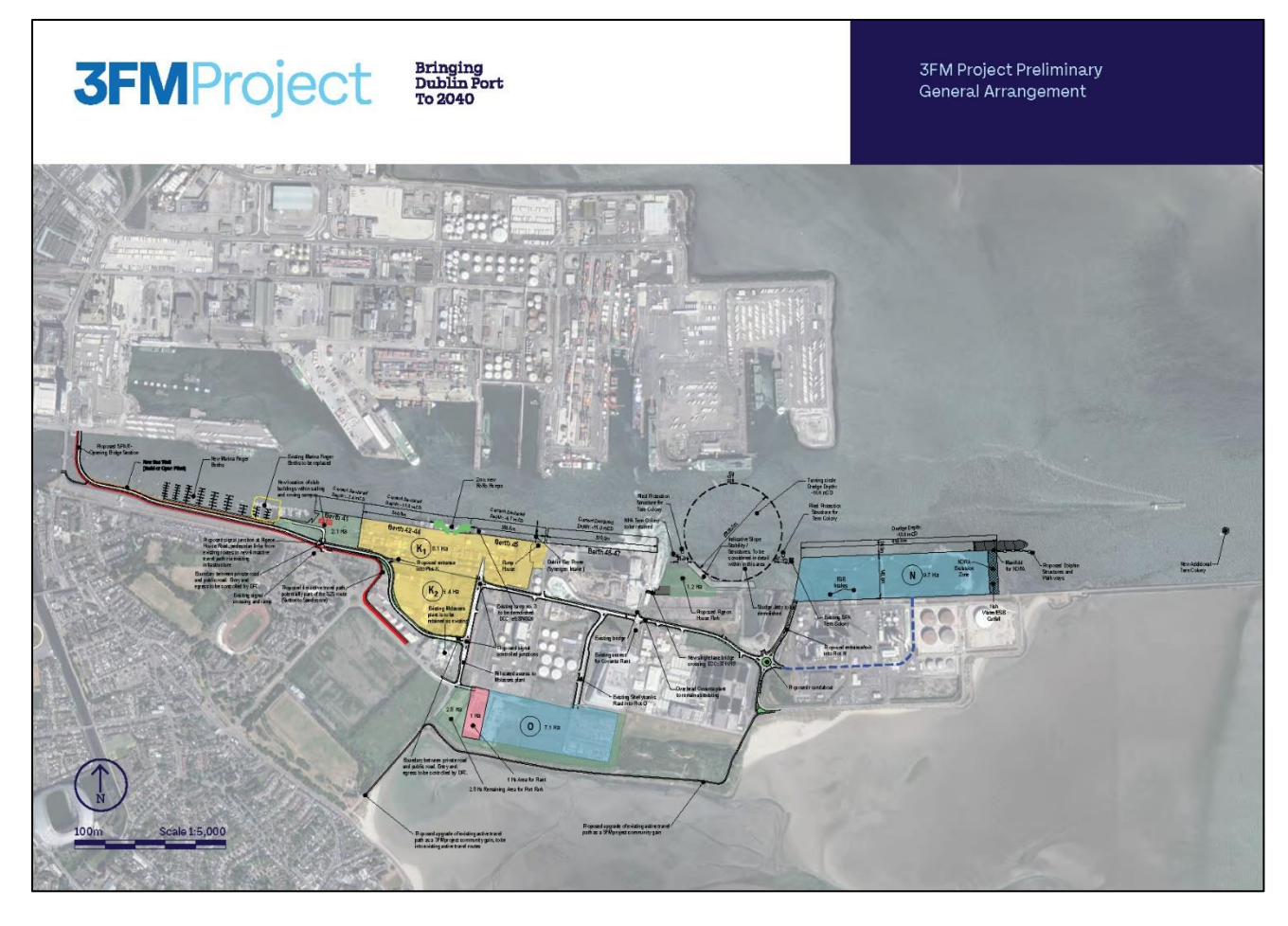
Figure 3.2 3FM Project General Arrangement (October 2021) Note: this General Arrangement is assessed as Option 2 in Chapter 4, Assessment of Alternatives.

In November and December 2021, DPC undertook an initial public consultation process, when details of the 3FM Project were set out for public review and feedback. The consultations were based on a discussion of the 3FM Project Preliminary General Arrangement Drawing (October 2021) as shown in Figure 3.2.