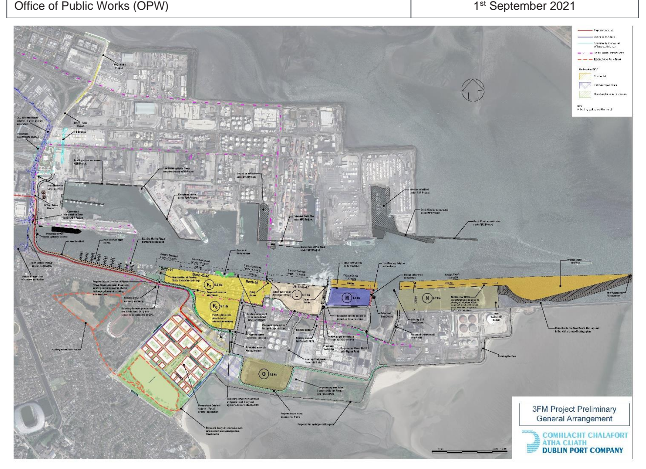
Figure 3.1 3FM Project Preliminary General Arrangement (March 2021) Note: this Preliminary General Arrangement is assessed as Option 1 in Chapter 4, Assessment of Alternatives.

The issues raised during the consultation meetings which have fed into the informal or non-statutory scoping of the EIAR and NIS and evolution of the 3FM Project are set out in Table 3.3.