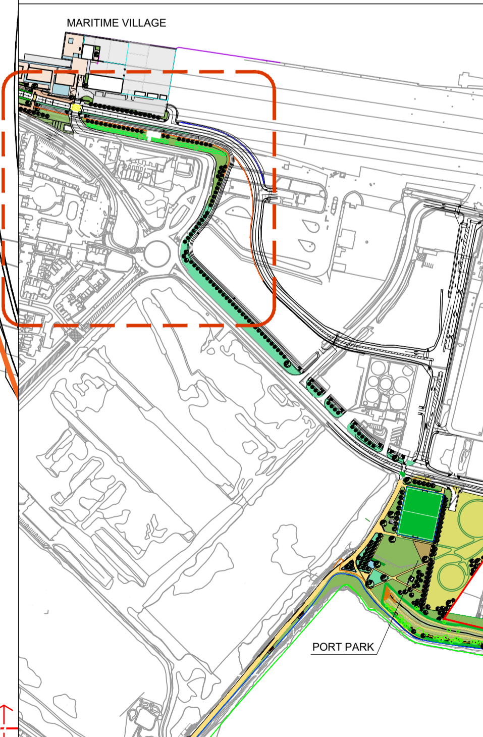
KEY PLAN, Scale 1:5000